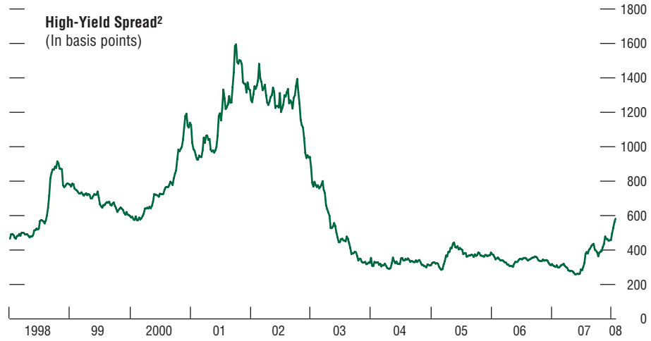
Figure 12. Europe: Corporate Bond Market 1