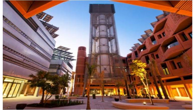
District Cooling, Abu Dhabi