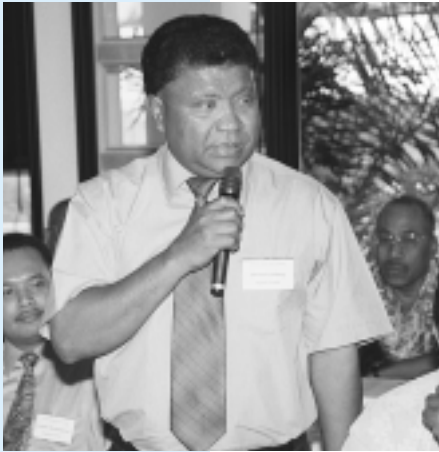
Elbuchel Sadang, Minister of Finance, Palau.

As Manjula Luthria (World Bank) explained, however, economic growth will require job creation. And the path to more jobs, she said, lies in promoting education and boosting private sector