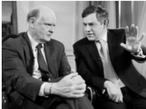
U.S. Secretary of the Treasury John Snow (left) and U.K. Chancellor of the Exchequer Gordon Brown confer at the G7's New York meeting.

Although the main purpose of the meeting was to agree on the agenda for the annual economic summit