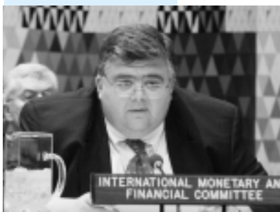
IMF Deputy Managing Director Agustin Carstens briefs participants on the outcome of the April 24 meeting of the International Monetary and Finance Committee.

On April 26, the United Nations (UN) Economic and Social Council (ECOSOC) met for the seventh annual high-level dialogue with the Bretton Woods institutions and the World Trade Organization (WTO). The meeting, which took place at UN headquarters in New York City, took up issues related to maintaining the political momentum for implementing the Monterrey Consensus and achieving the UN Millennium Development Goals (MDGs).