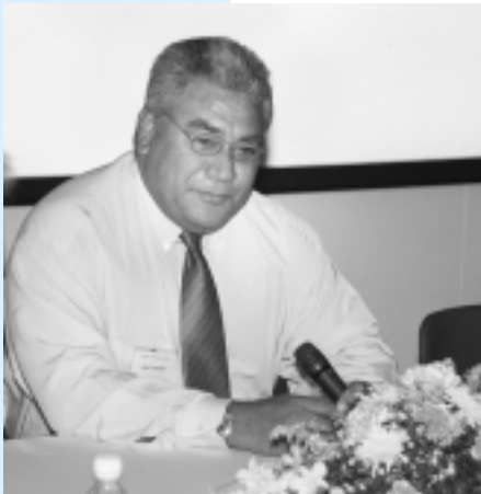
Maatia Toafa, Deputy Prime Minister, Tuvalu.