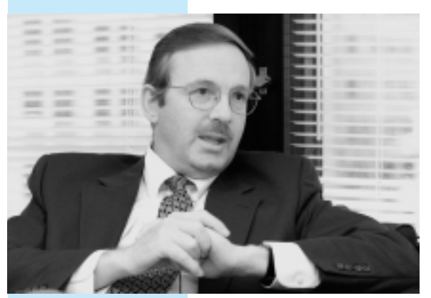
Brau: "Incomplete or misleadina information compromises our ability to judge policy aspects correctly and undermines the very integrity of our operations."

The first step for us is to request information from the central bank. Once we examine this information, the staff concludes either that the requirements have been met, that questions remain to be answered, or that significant vulnerabilities appear to exist. In the latter two cases, the staff requests a visit to discuss these matters with the central bank on the spot. Usually the staff team is from the Treasurer's Department; at times,