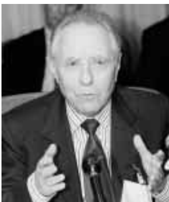
Carlo Azeglio Ciampi, Minister of the Treasury of Italy

A variety of initiatives to strengthen the architecture of the international monetary system will be a primary focus of the meeting of the Interim Committee of the IMF's Board of Governors, which is being held in Washington on April 27. In addition, the Interim Committee will review recent developments in the world economy, particularly the policy responses to the crises that have affected East Asian countries, Russia, and Brazil; progress in the Enhanced Structural Adjustment Facility (ESAF) and the initiative for the Highly Indebted Poor Countries (HIPC); and IMF assistance to post-conflict countries. The Committee is also expected to discuss ways in which the international community can most effectively evaluate the regional impact of the crisis in Kosovo, coordinate the humanitarian effort, and start preparing for reconstruction.