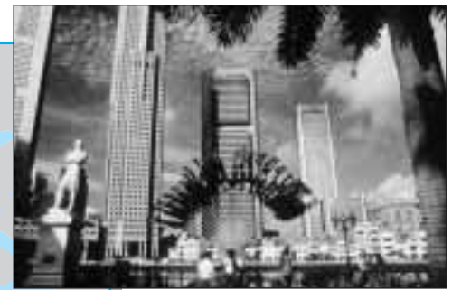
Center of Singapore

• Financial sector. In addition, Singapore is implementing important financial sector reforms. The financial and business service sector accounts for some 31 percent of Singapore's GDP, reflecting the country's long-standing