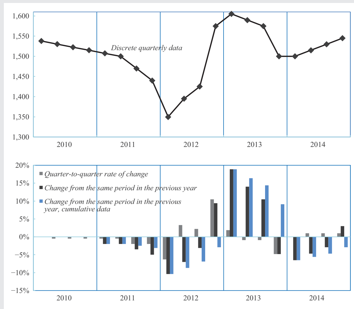
Example A1.1 Identification of Turning Points (continued)

may differ from year to year). Moreover, in addition to any irregular events affecting the current period, these year-to-year rates of change will reflect any irregular events affecting the data for the same period of the previous year.