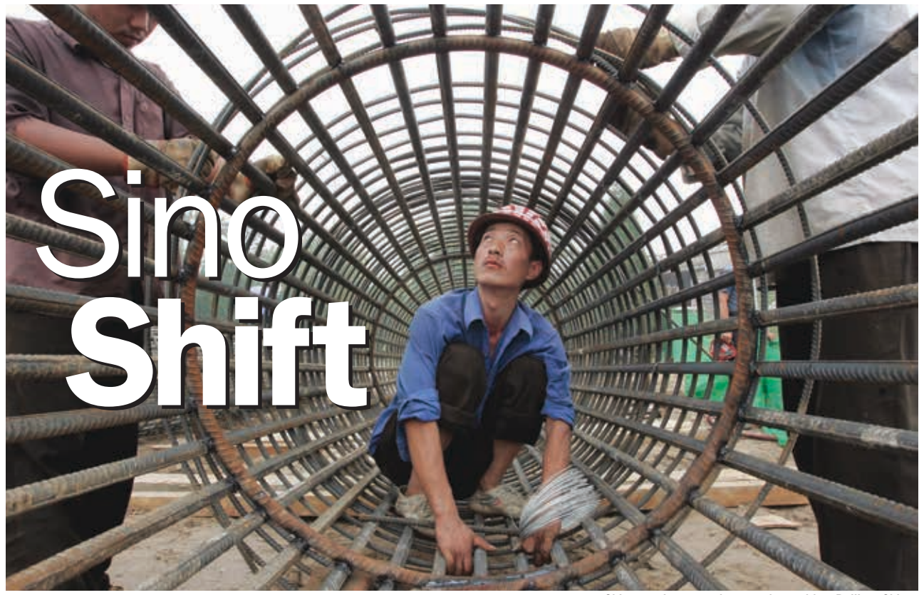
Chinese migrant worker attaches cables, Beijing, China.