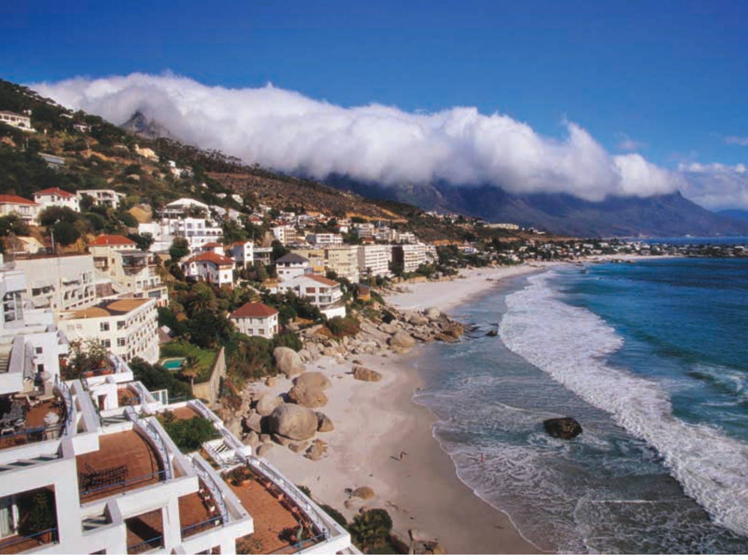
Beachfront neighborhood, Cape Town, South Africa.