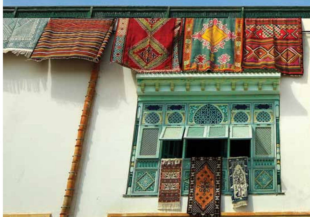
Kilim shop in Mahdia, Tunisia.

Private enterprise, driven by a nascent middle class, is the key to successful democratic transition in the Middle East