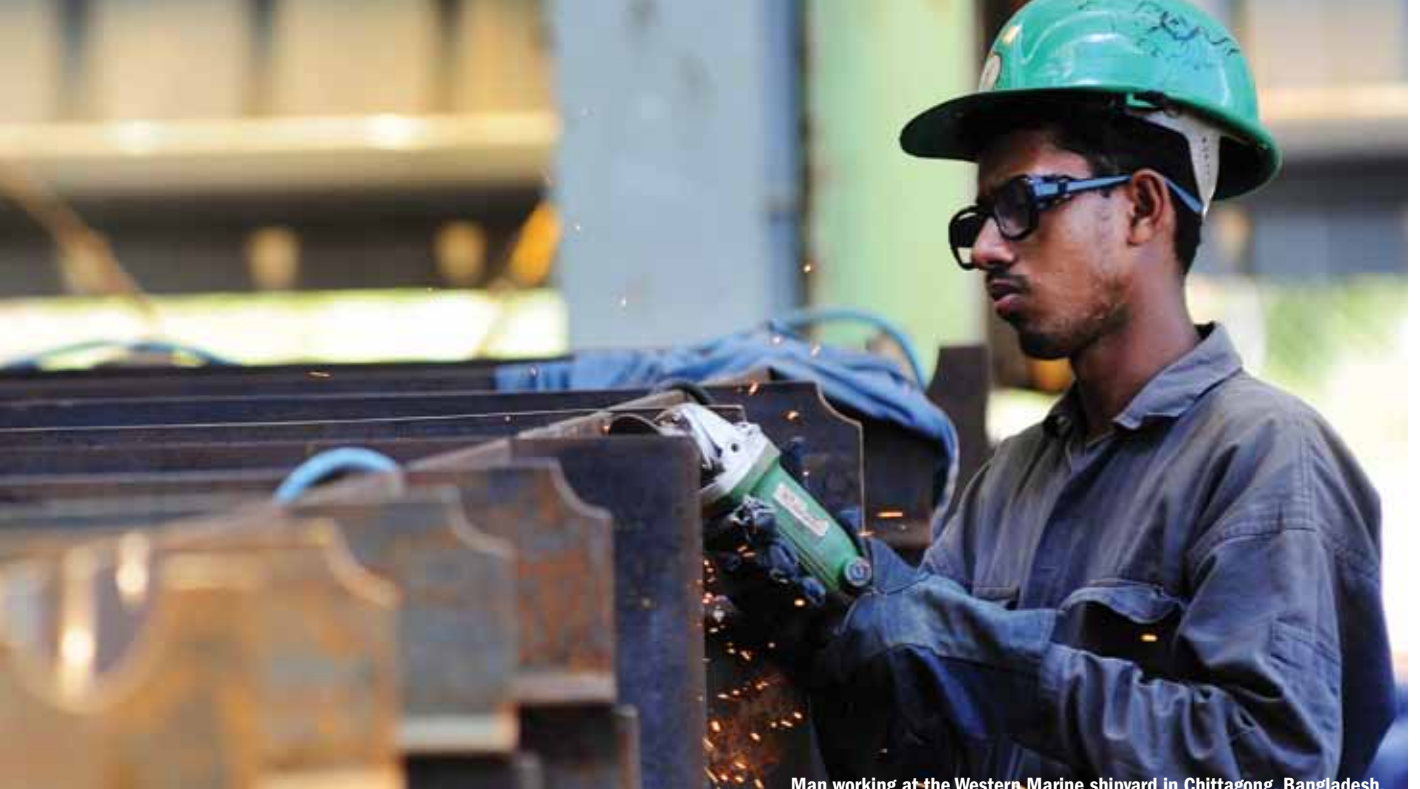
Man working at the Western Marine shipyard in Chittagong, Bangladesh.