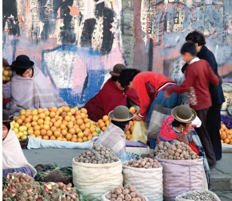
A street market in La Paz, Bolivia.