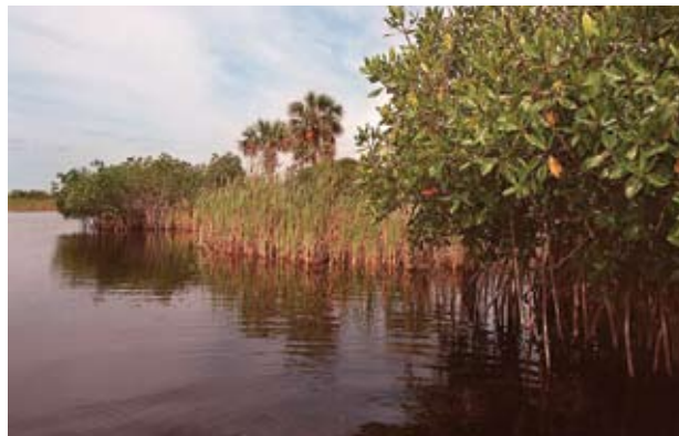
Mangroves protect coastal areas against erosion, cyclones, and wind.

Mangroves—salt-tolerant evergreen forests found along coastlines, lagoons, rivers, and deltas—are important ecosystems providing wood, food, fodder, medicine, and honey. They are also habitats for animals such as crocodiles, snakes, tigers, deer, otters, dolphins, and birds. Australia, Brazil, Indonesia, Mexico, and Nigeria together account for about 50 percent of the total global mangrove area.