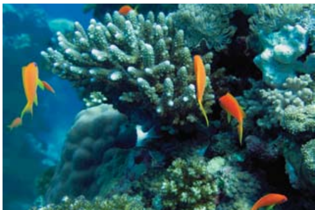
Climate change worsens prospects for survival of coral reefs.