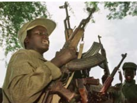
Child soldiers in Sudan.