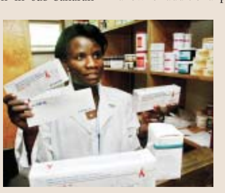
A Kenyan nurse prepares anti-retroviral HIV/AIDS drugs at Mbagathi hospital in Nairobi.

Fourth, the IMF is helping countries build capacity for spending aid inflows and domestic resources effectively and transparently. This includes designing and implementing appropriate macroeconomic policies, improving public expenditure management systems, and generally strengthening capacity in central banks, and in finance and some line ministries.