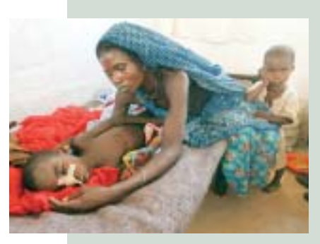
A mother comforts a five-year-old boy at an aid camp in Sudan where thousands of refugees are receiving food and medicines.

World hunger is rising, according to a new United Nations report, The Right to Food , that calls into doubt whether the world can meet the Millennium Development Goal that targets halving the number of hungry people by 2015. Although the world has more than enough food to sustain all people, a dozen children under the age of five die every minute from hunger-related diseases and the number of malnourished is on the rise, a UN expert says. Jean Ziegler, the Special Rapporteur on the right to food, says 842 million people were permanently or gravely undernourished in 2003, an increase of 2 million on the previous figures. Hunger levels have risen every year since the World Food Summit in 1996 called for global action to stem the trend.