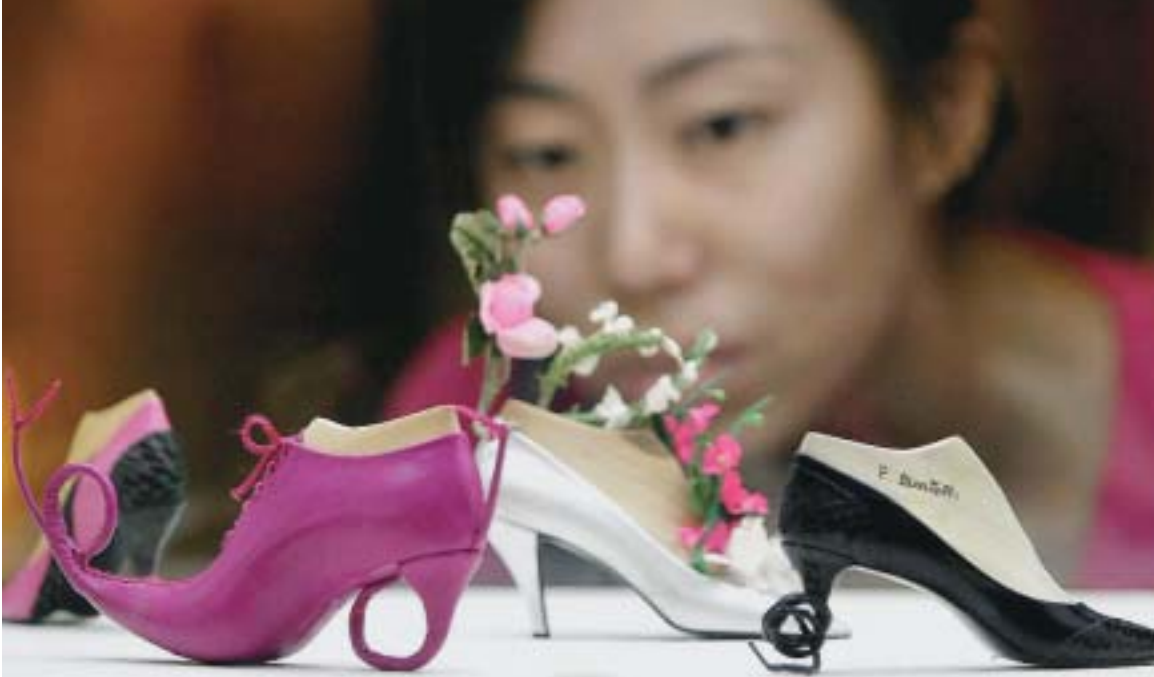
Miniature shoes displayed at an Italian trade exhibition in Beijing, China, where economic reform has been pursued one step at a time.

Is tackling corruption, by improving the rule of law, another part of the solution? The cross-country data show that corruption significantly slows growth (Mauro, 1995). If India were to cut its corruption level to, say, Italy's, then, according to these regressions, its growth would rise by 1 percentage point. As with any other single policy, cracking down on corruption helps but is no panacea.