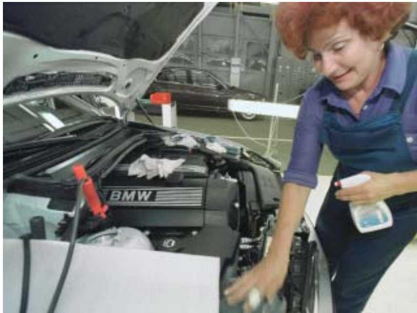
Car factory in Kaliningrad, Russia, where big bang reforms jolted industry.

While it appears that only Central Europe has fully recovered and begun to see positive output benefits, this is not really the case because the official Soviet GDP in the 1989 benchmark year underestimated the value of services, overestimated unusable and unsalable products, and took no account of the frequent nonavailability of consumer goods or the time consumers spent standing in line for products. Aslund (2001) adjusts the output index for only some of these problems, finding that in Central Europe virtually no fall in output occurred and that most countries were well beyond the initial