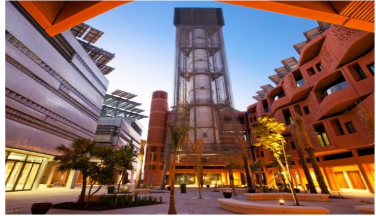
District Cooling, Abu Dhabi