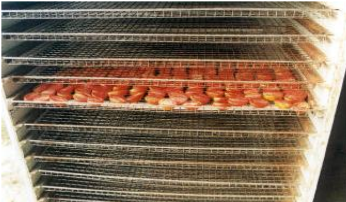
Drying of Tomatoes, Greece