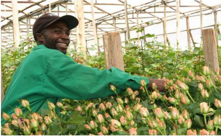
Flower Growing, Kenya