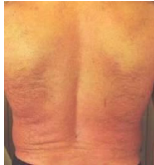
4 weeks treatment at Blue Lagoon Medical Clinic.