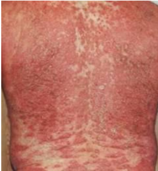
71 year old man from the Faeroe Islands. 2 years history of psoriasis.