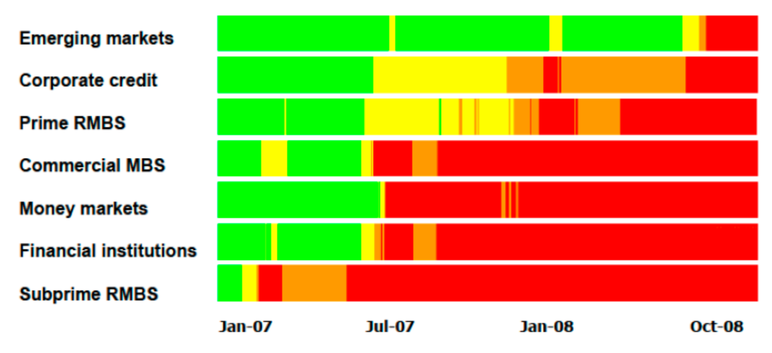
Figure 4. Contagion Across Assets, Institutions, and Countries