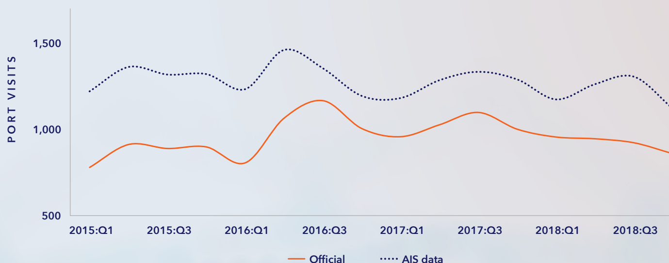
Figure 1. Malta: Port Visits