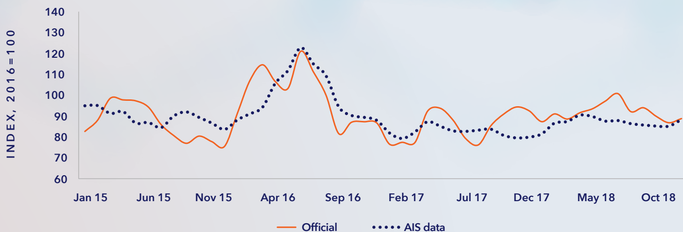
Figure 2. Malta: Trade Volumes