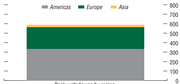
Figure 1.14. Financial Sector Losses (In billions of U.S. dollars 2007:Q2 through August 2008)