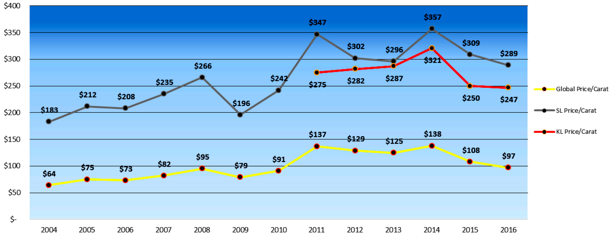
Sierra Leone - KPC and Koidu Limited Data Utilized