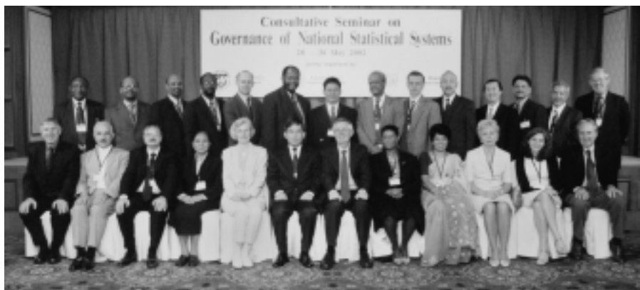
Heads of national statistical agencies and central bank units from around the world attended the three-day seminar on governance, which also drew senior representatives from international and regional organizations.