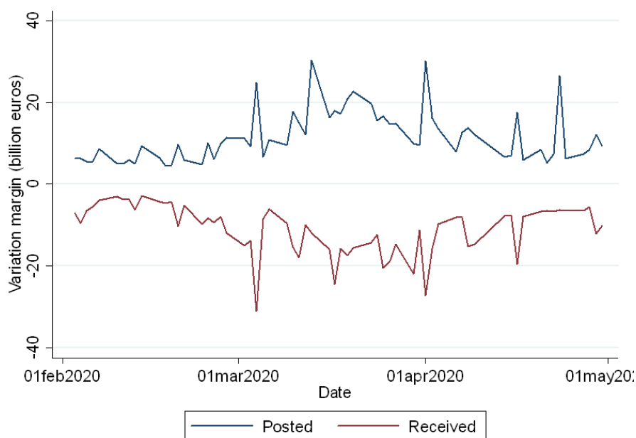
Figure 2: VM flows of euro area non-bank entities.