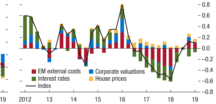
4. Financial Conditions Index: Systemically Important Emerging Market Economies Other than China

Sources: Bank for International Settlements; Bloomberg Finance L.P.; Haver Analytics; IMF, International Financial Statistics database; and IMF staff calculations. Note: The z-score indicates an observation's distance from the population mean in units of standard deviation. EM = emerging market.