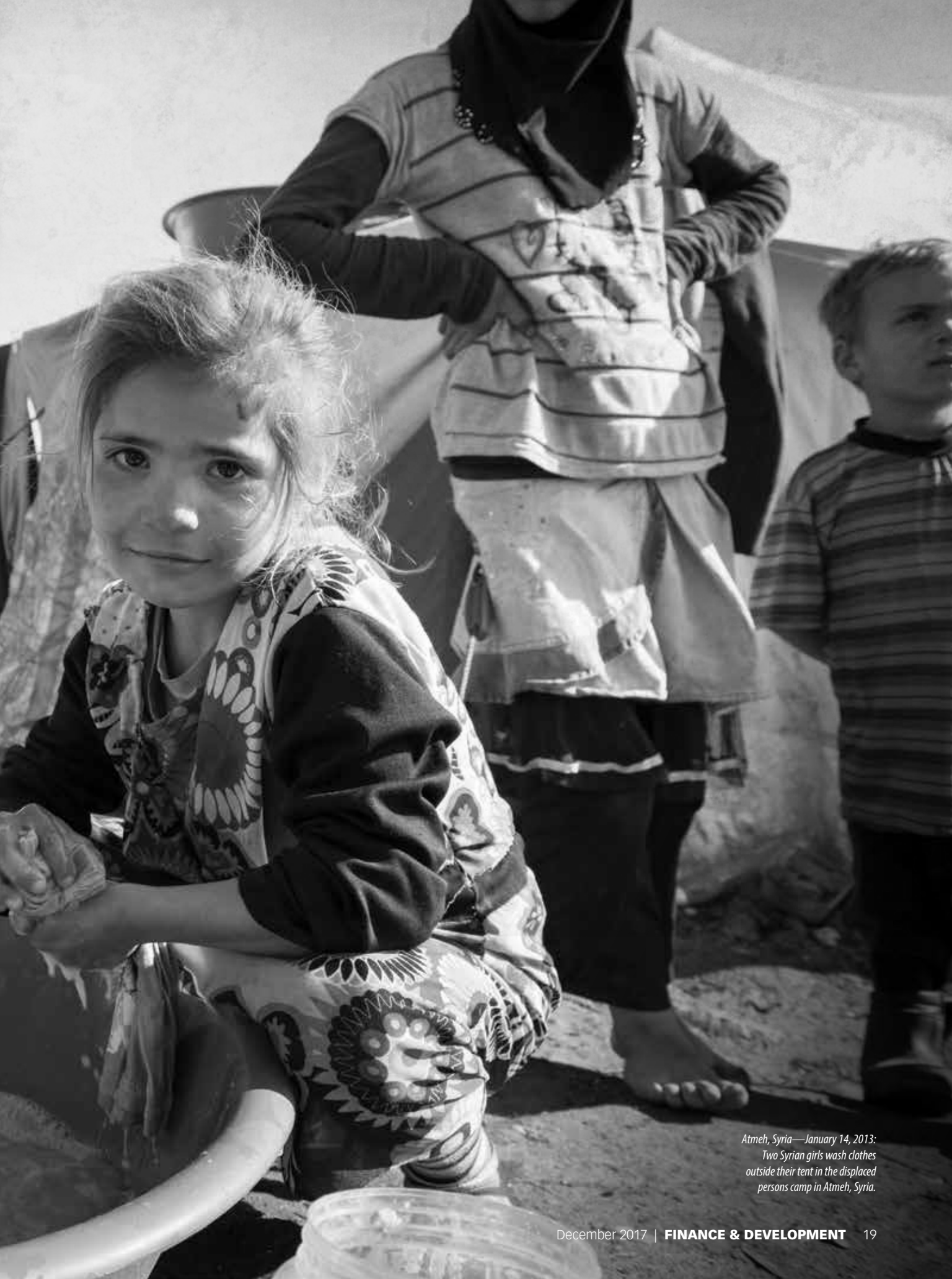
Atmeh, Syria—January 14, 2013: Two Syrian girls wash clothes outside their tent in the displaced persons camp in Atmeh, Syria.