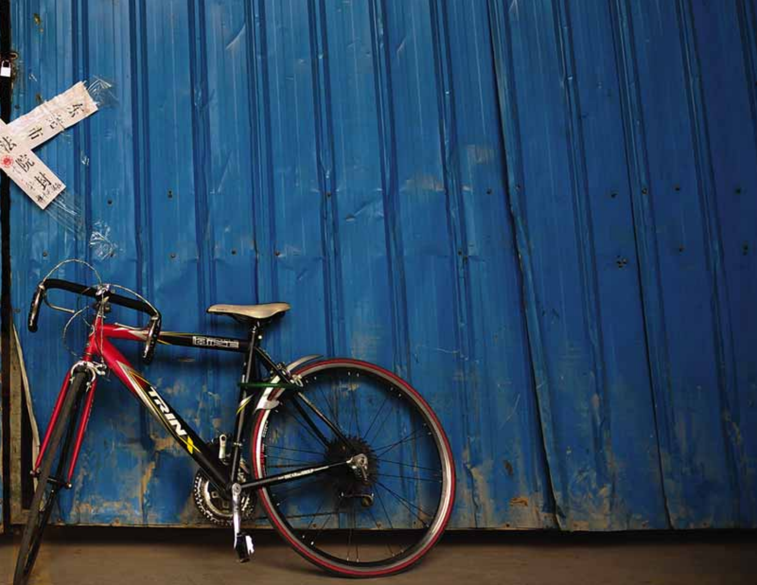
A sealed factory in Dongguan, China.

And what are the possible policy responses? These are the key questions we address in this article.